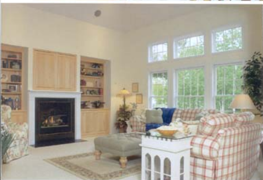
Left: Maple cabinetry from Bloch Industries echoes the kitchen design and handsomely houses family room storage and the entertainment center, with surround sound built into the soaring tray ceiling. The gas fireplace has granite trim and stacked transom windows provide loads of light and a lovely view.

obvious, then you know he cares about the hidden things, too."