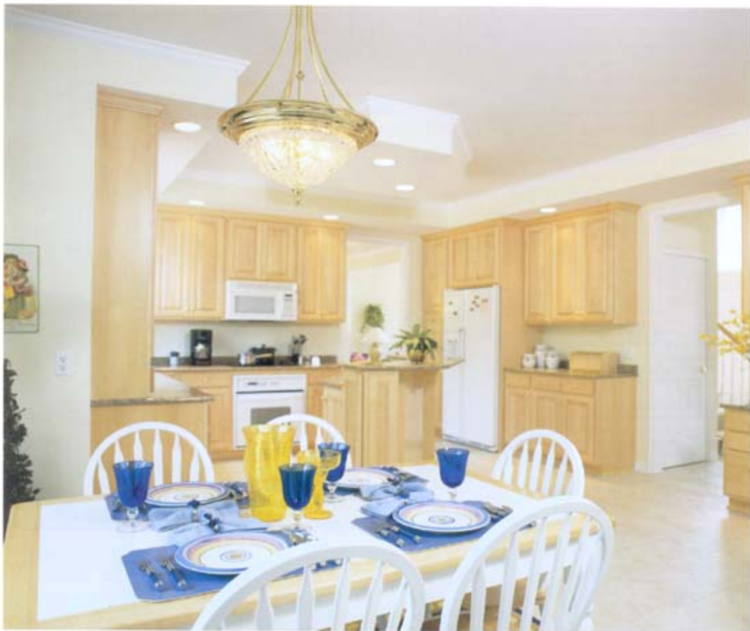
Above: Bloch Industries designed and installed this family-sized kitchen with light maple cabinets and gleaming granite countertops. Crown molding and soffit lighting dress up the kitchen to easily meld with the adjoining family room.